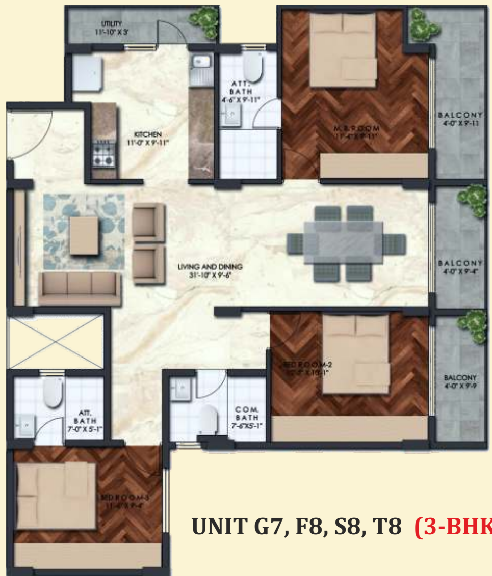
UNIT G7, F8, S8, T8 (3-BHK)