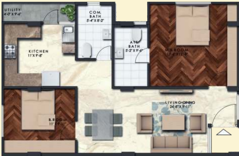
UNIT G4, F5, S5, T5 (2-BHK)