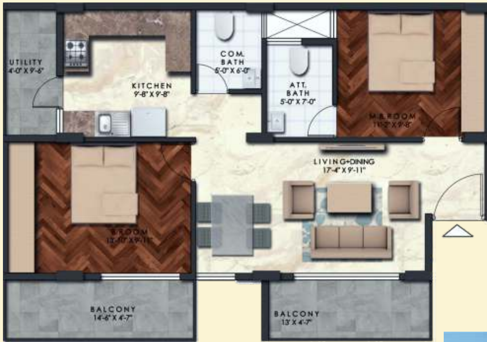
UNIT G1, F1, S1, T1 (2-BHK)