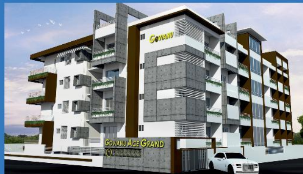
Govianu Ace Grand Yeshwanthpura