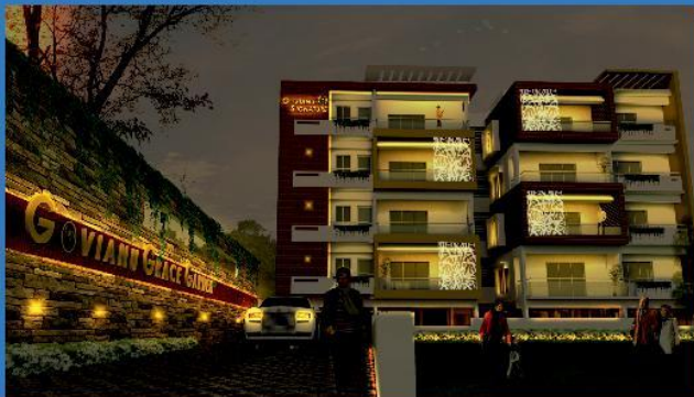
Govianu Grace Garden Benson town

Our success is driven by more than building some of the most advanced facilities for our corporate, institutional, residential and government clients. More and more of our clients are turning to us for our distinctive ability to implement innovative project management techniques and to serve as a reliable provider of knowledge-driven solutions for their complex construction projects.