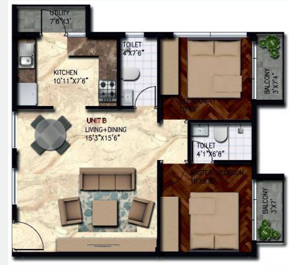
Configuration : 2BHK