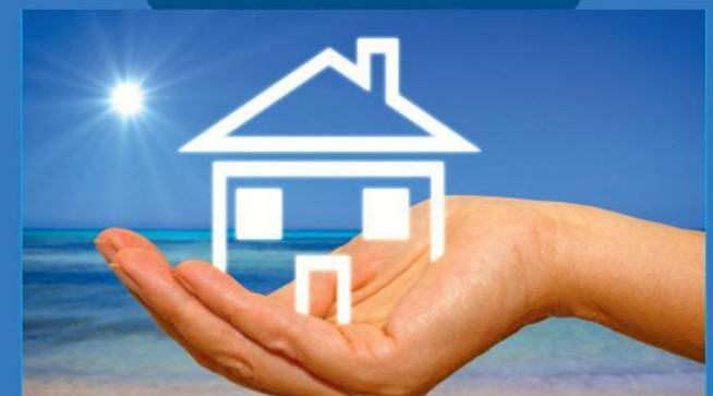
Govianu Meadows Malleshwaram