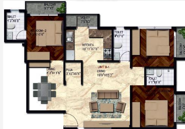
Configuration : 3BHK