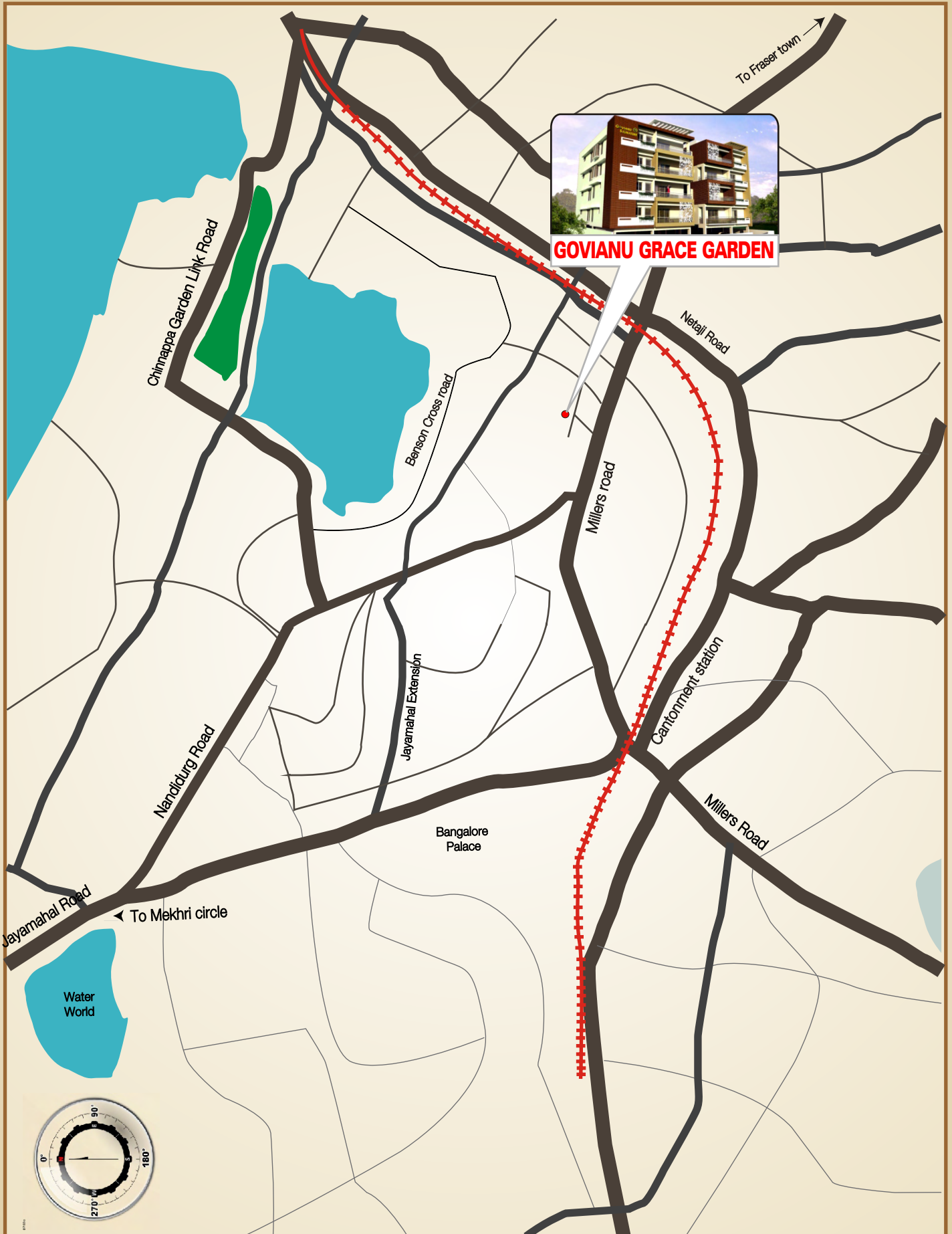
Route Map - How to Reach?